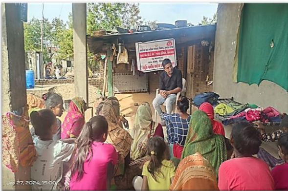
Aandanpura Village to Caminiti mitting