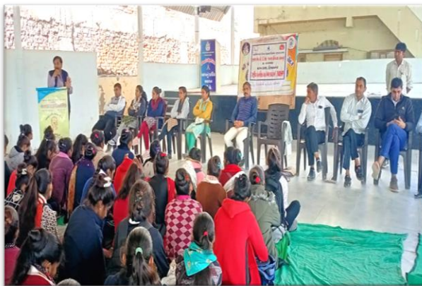
Caminiti mitting Aadarsh College Diyodar, Dist. Palanpur